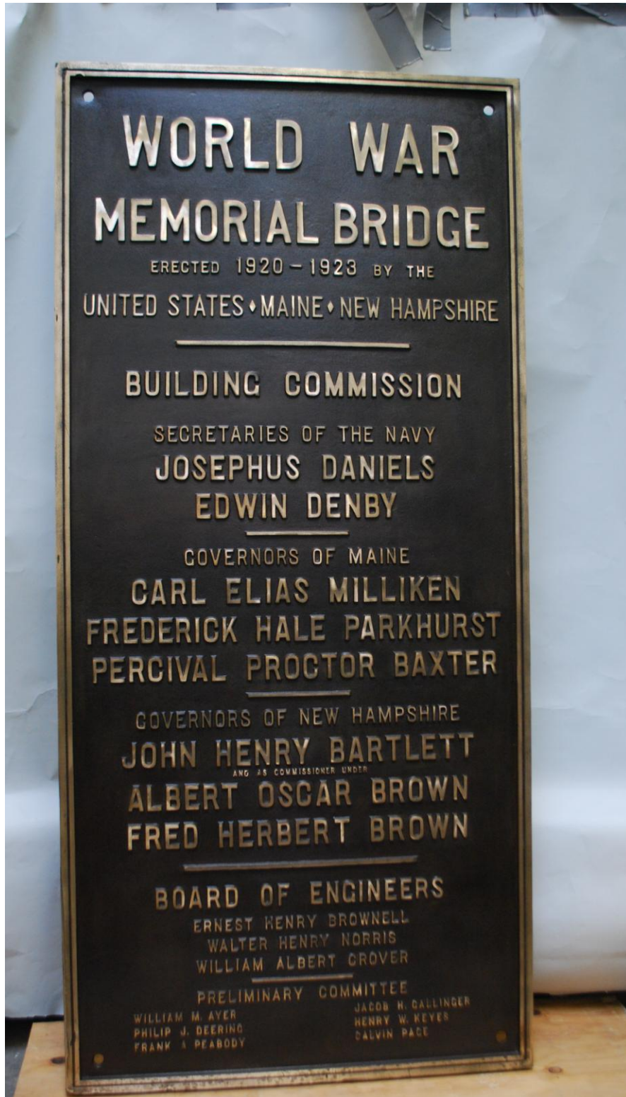
Plaque #2 After Treatment