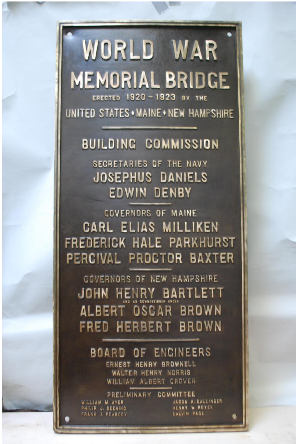
Plaque #1 After Treatment