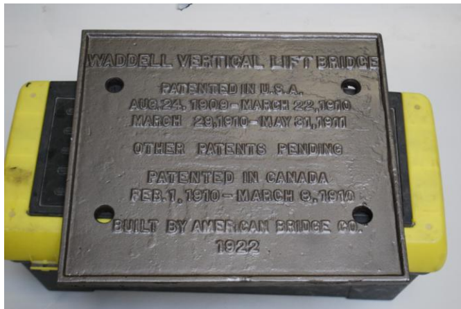
Plaque #4 After Treatment